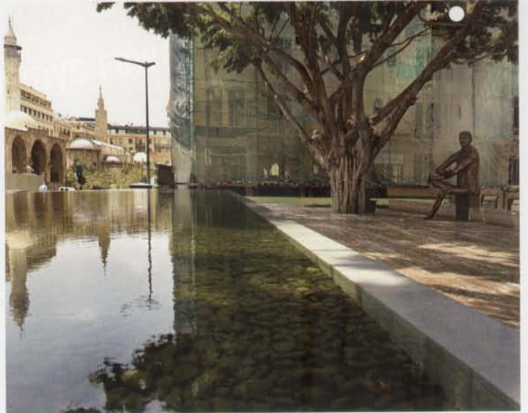
Samir Kassir memorial