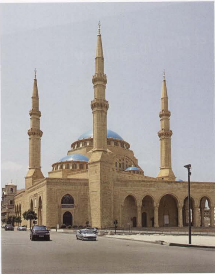
Mohammad Al Amine mosque