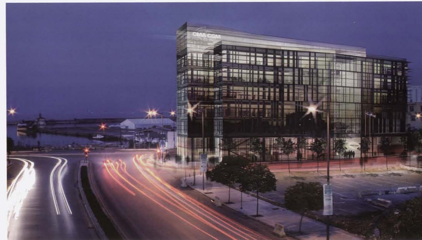
Above: Saifi Village, Beirut, absorbing the dual character of the site-bustling highways versus calm lining.