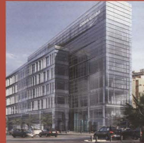
CMA-CGM Merit headquarters, Lebanon