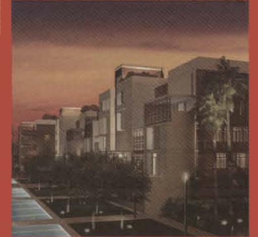
Doha Gardens, Doha