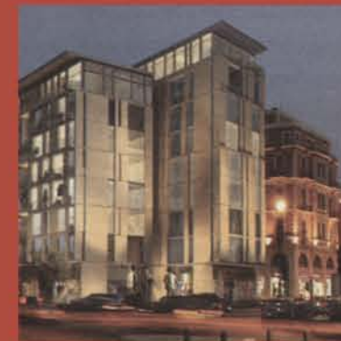
Foch 94 residential development, Lebanon