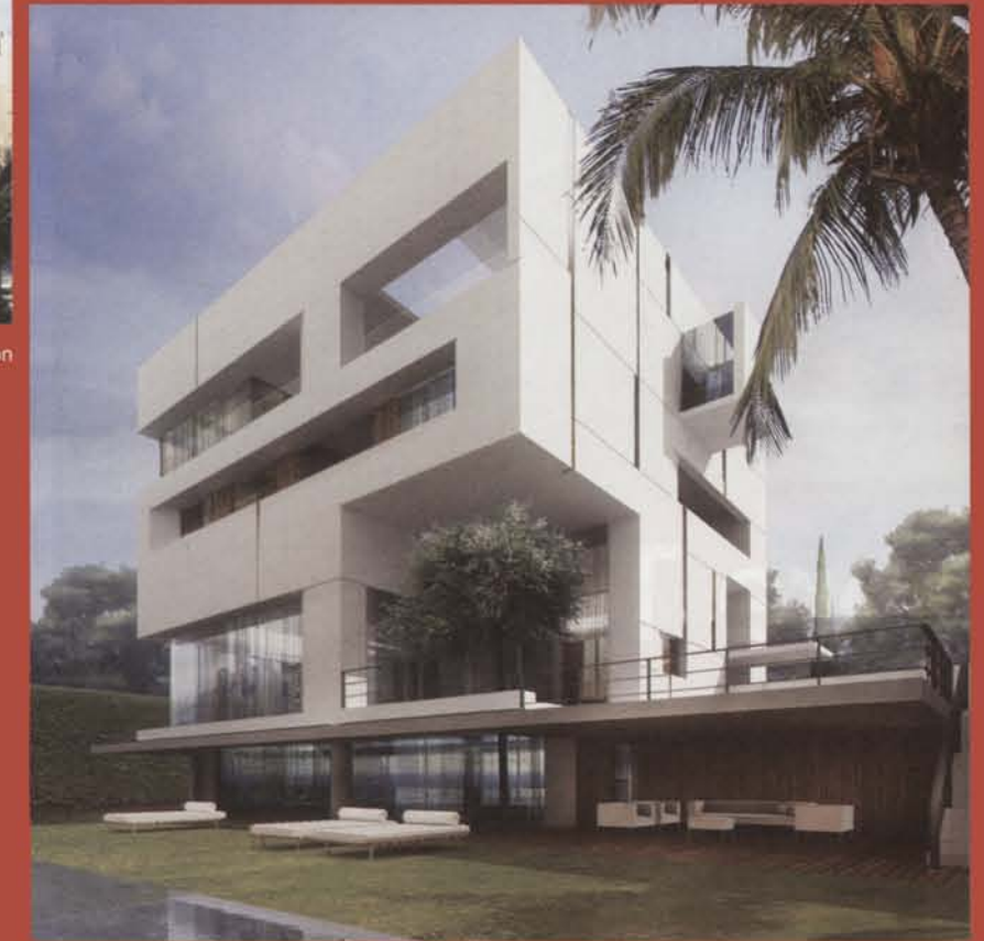
House in Adma, Lebanon