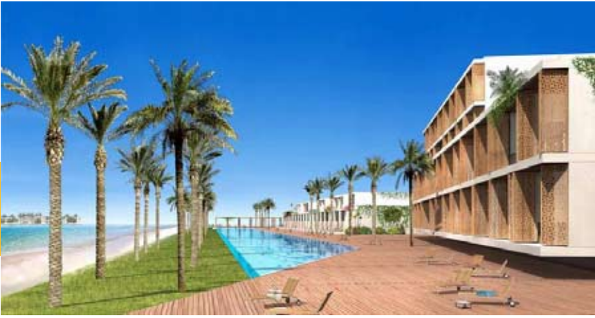
Architecture working with every given situation

The experience of space as a social phenomenon exists in many scales in Arab-Islamic domestic architecture. From the focus on the micro, on the flexible nature of furniture as architecture, to the macro, the ability to use any part of the house for living and work, in for example the living room or the courtyard. Design throughout this process is intricately linked to larger spiritual connections, pointing towards this other reality of religion and heritage if required or desired. Thus this situational aspect of architecture, the real of the given situation in architecture and domestic house planning, requires strategies that make spaces changeable in time from individual moments to years. Whether this in on a small scale with sliding or moving walls and screens or larger changes based on seasonal use, we see that when dictated by a given set of social or physical circumstances architecture must be open to situational change.