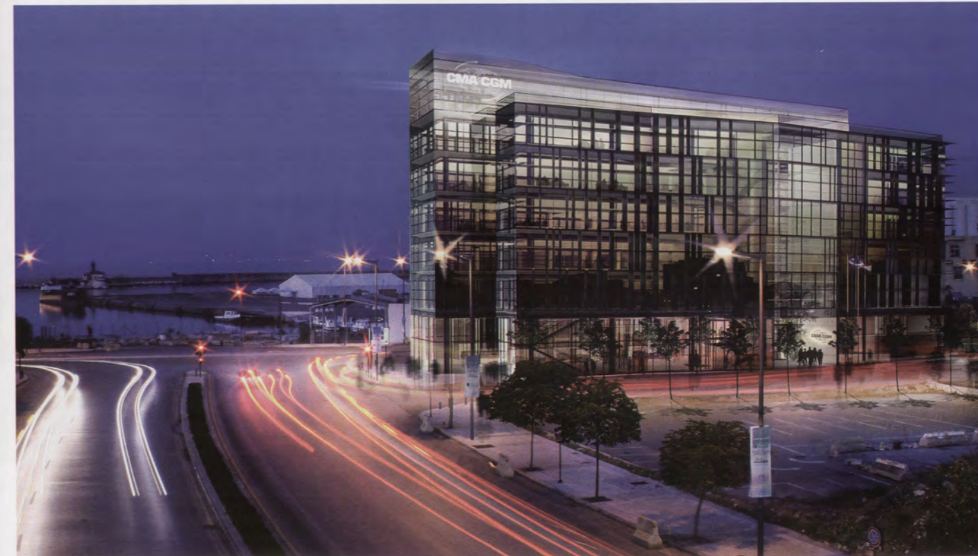
Above: Saifi Village, Beirut, absorbing the dual character of the site-bustling highways versus calm lining.